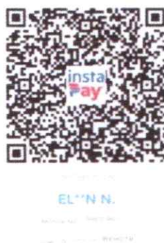
Figure 2. GCash QR Code