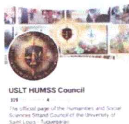
Figure 4. USLT HUMSS Council Official Facebook Page

The HUMSS Council Officers, Ka-TRIBO Club Officers, Guild of Louisian Debaters, and the Top 7 HUMSS Classroom Officers form the organizing committee. Members of the committee are not allowed to participate in contested events. The committee also maintains an official Facebook page, which serves as the main online platform for updates, announcements, and engagement with participants, as shown in Figure 4.