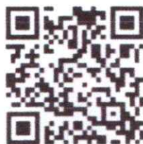
Figure 1. Registration Form QR Code

Louisian participants will directly proceed to the payment process as they are automatically registered, while outside participants must first register through the qr code on figure 1 as a school through one of their coaches. A confirmation of registration email will then be sent to the coach's registered email address once the organizing team has received the form. After registration, participants must proceed with the payment of the registration fee, which covers food and other paraphernalia to be used during the HUMSS Convention 2026. The corresponding registration fees are presented in Table 1. Registration period will begin by November 20, 2025 and will end by February 13, 2026.