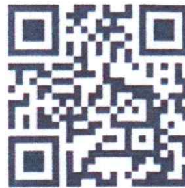
Facilitator's online Profile Form

Upon collecting the data, the BLSS-SSD shall generate a regional and division report to be sent to the Regional and Division Offices ESSD and SGOD Chief respectively.